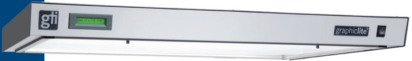
Above: GLE-532 with optional LiteGuard

For Superb Light Uniformity Over a Large Area