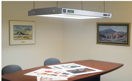
Above: GLE luminaires have a thin profile that is ideal for conference rooms and design studios.