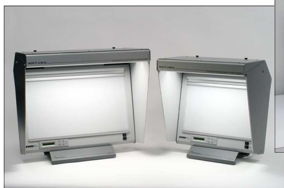
SOFV-1e and SOFV-2e