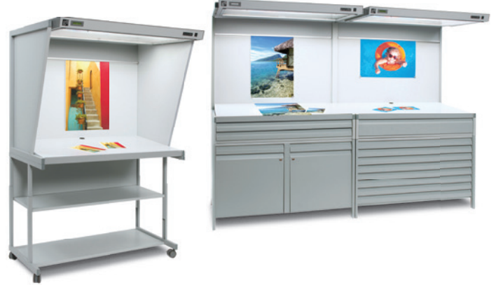
Above Left: An EVS-3052/FS viewing station with a height adjustable (at set-up) rolling floor stand and side walls (SW-EVS). Above Right: An EVS-30106 viewing station with two shallow flat file drawers (2F-3052) and two-door storage cabinet (SC-3052) on left, and one deep flat file drawer (1F-3052) and eight shallow flat file drawers (FD-3052) on right.

See ordering guides to create the configuration you require for your viewing needs.