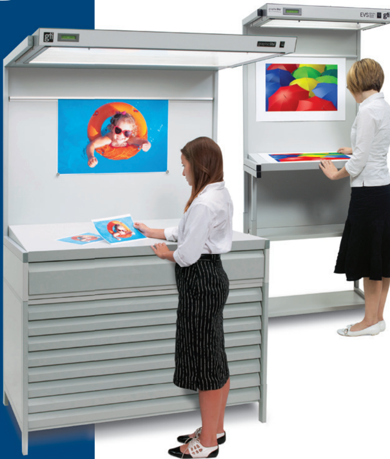
Above left: EVS-3052 viewing station with one deep file drawer (IF-3052) and eight shallow flat file drawers (FD-3052). Above right: EVS-2028 with a height adjustable (at set-up) rolling floor stand (EVS-2028/FS).

Providing Tight Conformance to the ISO 3664:2009 Standard