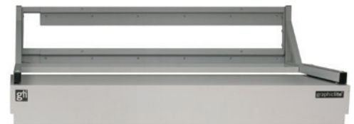
GTI's GLE (left) and GLL (right) series luminaires, shown with wall brackets, are available in 4- and 5-foot models. GLE luminaires have a front power switch and a power cord which plugs into a standard outlet. GLL luminaires must be hard wired into a switched power circuit. Both models are available with a wireless remote control.