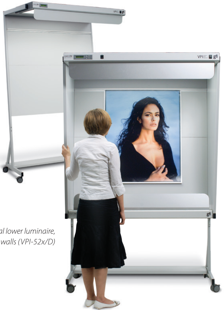
VPI-52 with an optional lower luminaire, digital dimming, and side walls (VPI-52x/D)

GTI is a leading manufacturer of tight tolerance lighting systems for critical color viewing, color communication, and color matching. An in-house spectroradiometric laboratory and a 100% measurement and verification production process guarantees that precision and accuracy is built into all products. All products are shipped with a certificate of product conformance (NIST traceable).